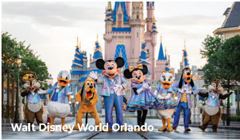
Walt Disney World Orlando

This 11D8N / 9D8N trip will take us to explore 7 states in East Coast of the US namely New York, New Jersey, Pennsylvania, District of Columbia, Maryland, Georgia & Florida for another level of travelling with lots of enjoyment and fulfilment to catch. Places to visit including the world bustling & never-sleep New York City & the Liberty Island, America's Birthplace City of Philadelphia, Capital City of Washington DC, Savannah in the American South, world-class theme parks city of Orlando such as Walt Disney World and Universal Orlando, and the world-famous Miami & Miami Beach. Onwards the trip is the 3D2N cruise to the Bahamas, significantly known for its nature beauty and clear blue water beach, with a stop at Freeport in Grand Bahama Island.