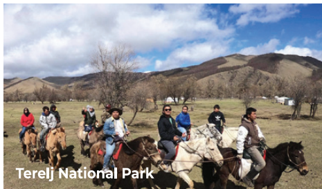
Terelj National Park