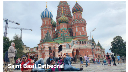
Saint Basil Cathedral