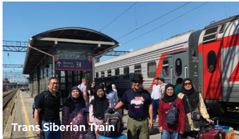
Trans Siberian Train