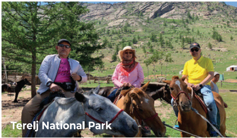
Terej National Park

This 16D13N / 14D13N trip will take us to explore, discover and pioneer the road less travelled expedition by train along the iconic Trans-Siberian railroad across 2 countries, Mongolia & Russia. The train expedition will start from Mongolia’s capital city, Ulaanbatar, and will travel all the way to Russia’s capital city, Moscow for a total of more than 7,500 km long. Our stop along the expedition including multiple cities and unique places such as Ulaanbatar, Terej National Park, Irkutsk, Lake Baikal, Novosibirsk, Yekaterinburg, Kazan & Moscow, together with a chance to learn & get along with nomad people in Gobi Desert for their unique lifestyle & culture. This is surely a must do once-in-a-lifetime trip which brings us an experience we will always remember of.