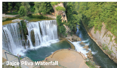
Jajce Pliva Waterfall