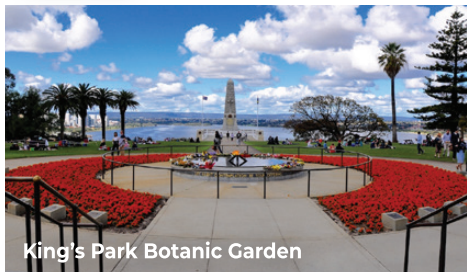
King's Park Botanic Garden